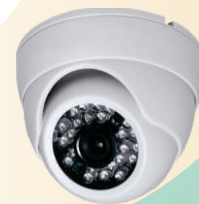
CC TV Camera