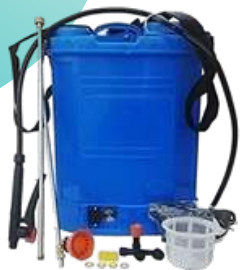
Battery Sprey Pump