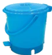
Dustbin with Foot Cap 10 to 15 Ltrs