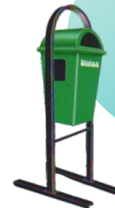
Litter Bins with Stand 80 to 100 Ltrs