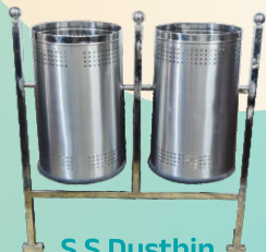
S S Dustbin 40 to 100 Ltrs.