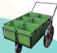
Six Bucket Wheel Barrow