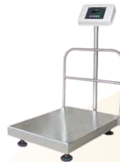
Eletronic Weighing scale