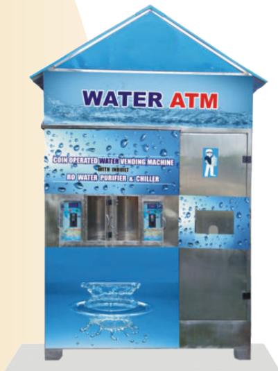
Water ATM Machine

Capacity : 250, 500, 1000, 1500, 2000 lph