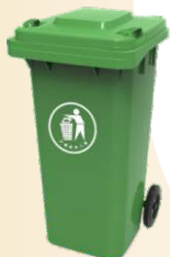
Garden Dustbin 60 to 100 Ltrs