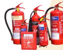
Fire Safety Equipments