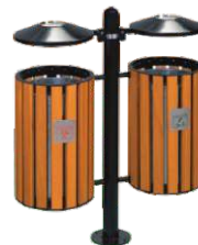
Double Dustbin Outdoor Bin 50 to 80 Ltrs