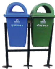
Plastic Dustbin 100 Ltrs with twin stand