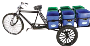
Tricycle with 6 bins