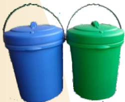
Dustbin with Cap 10 to 15 Ltrs