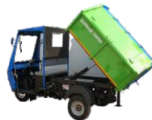
3-4 Wheel Door to Door Solid Waste Collection