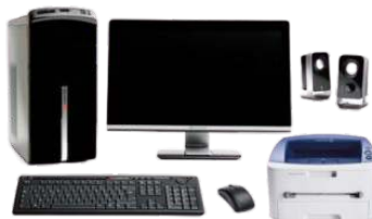
Computer Set with Printer