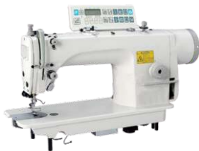
Electric Sewing Machine